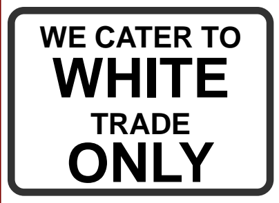
Store sign common in the segregated South.