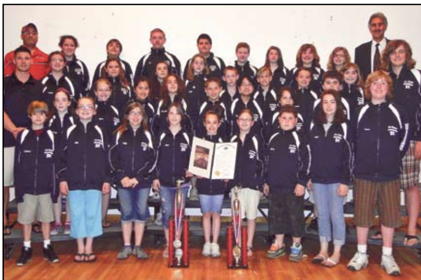
Congratulations to New Castle Christian Academy on winning the state archery championship.