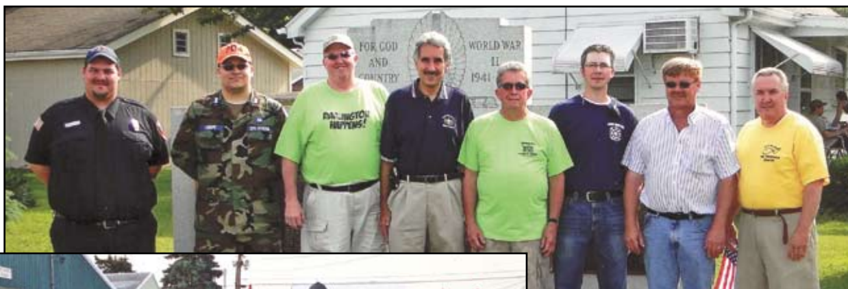
I participated in the opening ceremony for Darlington Days.