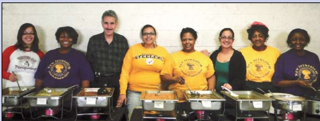
It was my honor to join the Dr. Martin Luther King Day luncheon at New Jerusalem Church.