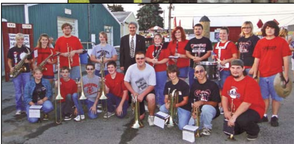
The Mohawk Band performed at the opening ceremony for the Lawrence County Fair.