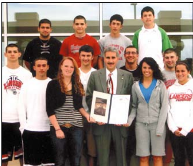
Neshannock sports teams had championship seasons.