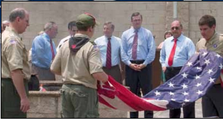
Scouts prepare one of the U.S. flags for proper disposal during the recent flag retirement ceremony.