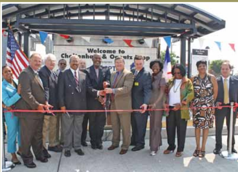
Mass transit milestone. Rep. Curry joins SEPTA, local and state officials, and members of the community to celebrate the completion of Cheltenham and Ogontz Bus Loop renovations. The $3.4 million project resulted in a safer, more customer-friendly transit hub.

H2O PA provides grants to independent agencies, municipalities or municipal authorities for the construction of drinking water, sanitary sewer and storm sewer projects or to help repair, rehabilitate or remove high-hazard unsafe dams.