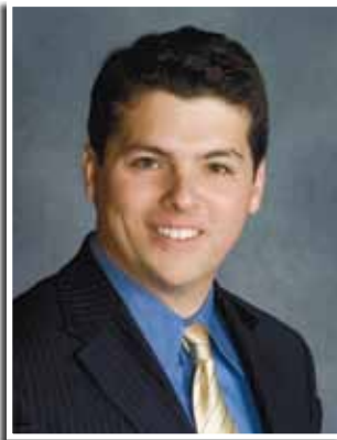
State Representative Brendan F. Boyle