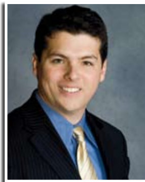
State Representative Brendan F. Boyle