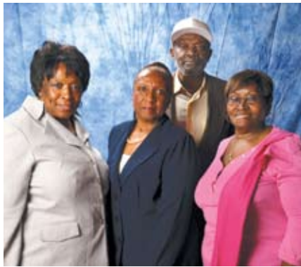
Seniors were treated to Red Carpet photos at the Senior Expo.