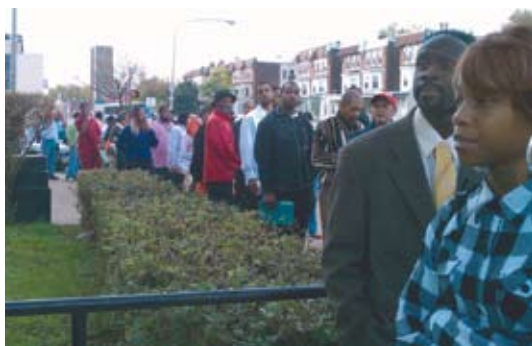
Hundreds of job seekers stand in line to attend the job fair at Beloved St. John’s in October.