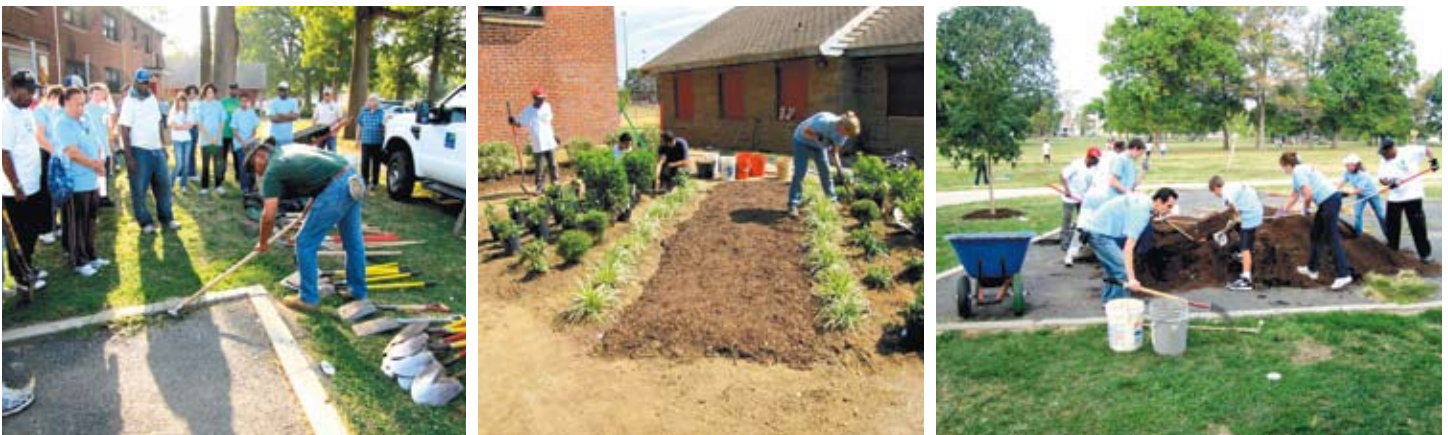
Members of Hunting Park United work restoring and beautifying the park surrounding the recreation area.