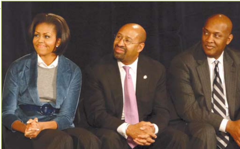
First Lady Michelle Obama, Mayor Michael Nutter and Rep. Evans at the Fairhill Elementary School in February. The first lady is leading the fight nationwide against childhood obesity.

grants and loans to 78 food market projects across the state, ranging in size from 1,000 to 69,000 square feet. In total, these projects are expected to preserve or create 4,860 jobs and more than 1.5 million square feet of fresh food retail space across Pennsylvania.