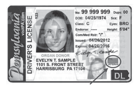
Veterans Designation on PA Driver's License/ID Cards www.dmv.pa.gov