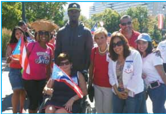
My colleagues, friends and I enjoyed the great company and wonderful weather at last year's Puerto Rican Day Parade in Philadelphia.

This project has the potential not only to improve water quality on-site by capping contaminated soil and installing above-ground and subsurface storm water filtration systems, but it is also expected to have a positive impact on water throughout the city. In addition, the initiative is slated to bring roughly 175 jobs to the area, and I am hopeful that the shopping center will help provide an economic boost to our region. I appreciate that the state is financing such an important initiative and will be watching the project's development.