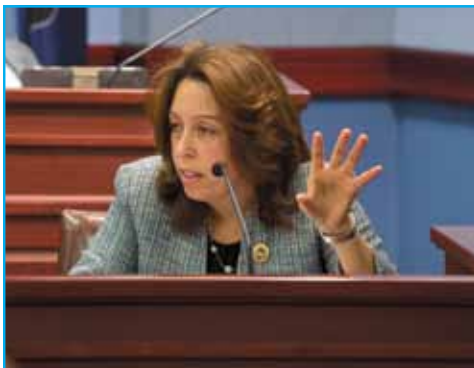
I suggested that the definition of "legislative nonprofit organization" needed to be further clarified when discussing a bill during a House State Government Committee meeting.