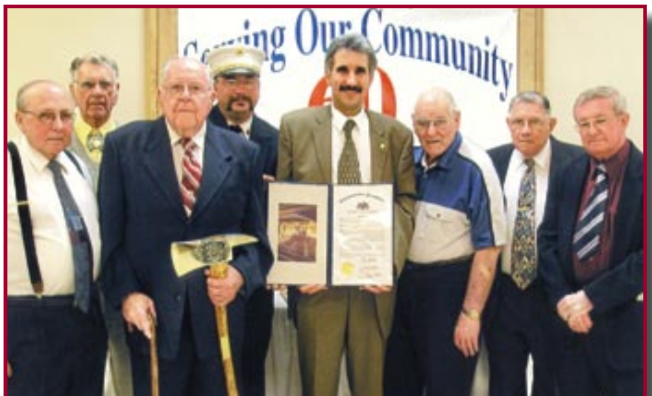
Rep. Sainato honors the Union Township Fire Department on its 60th anniversary.

In addition, utilities would be able to seek restitution in civil court for the amount of service stolen, and fire departments or other emergency responders answering a call caused by energy theft also would be able to recover their costs.