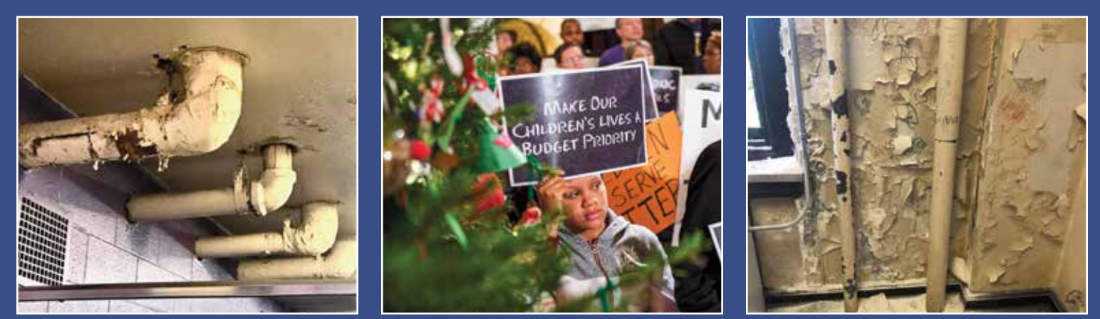
Above Pictures: Actual Conditions within our Public Schools. Students, Teachers, Lawmakers and Activists gather in Harrisburg.

Because of our work to make children's lives a budget priority, the Governor just announced that he's committed to getting over $1 billion to schools to do emergency repairs. I will keep fighting to make sure schools in our district get this much needed funding.