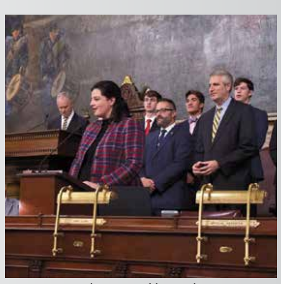
Honoring North Penn's Athletic Achievements on the House floor.