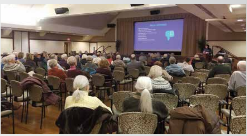
First Town Hall of 2020, held at Foulkeways at Gwynedd.