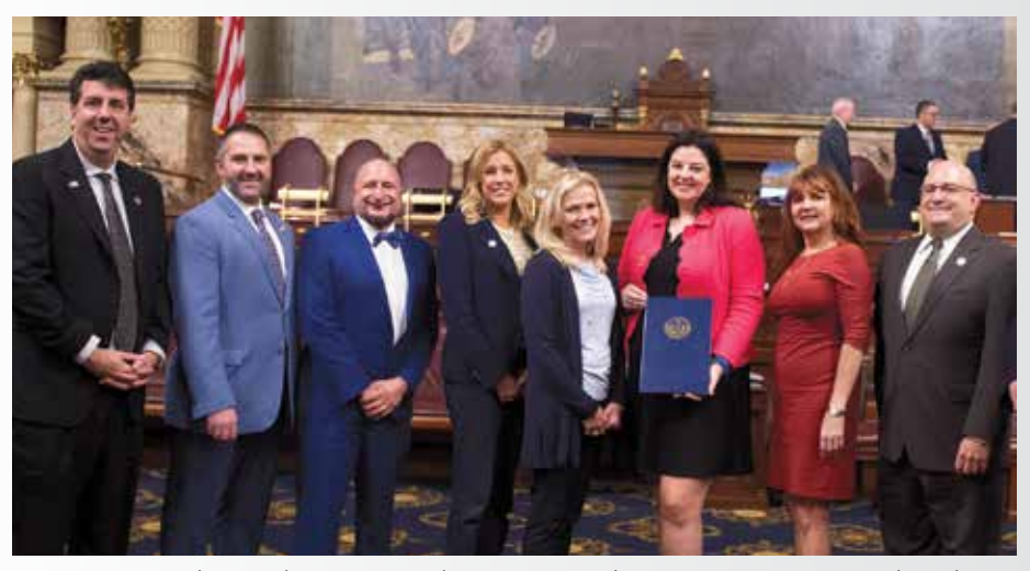
House resolution observing October as Civics Education Awareness Month and honoring the Montgomery County Bar Association's 10th year of its 6th grade civics "Law and Liberty" program.