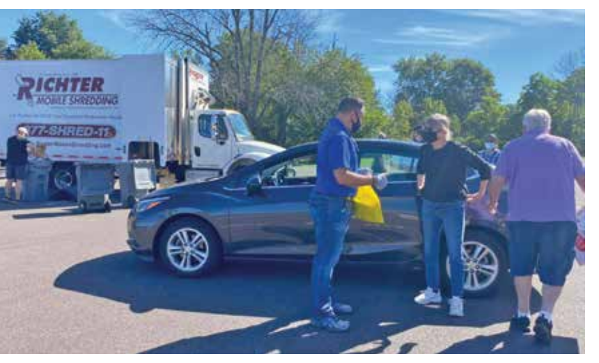
Thanks to all who came out to my shred event in September. If you couldn't make it, I'm hosting another one on May 15!