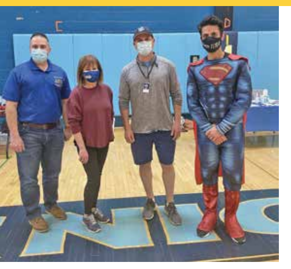
North Penn High School and Skippack Pharmacy worked together to host several mass vaccination clinics in our area, immunizing thousands of residents.