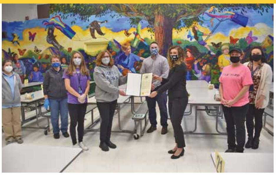
I was proud to present an award to North Penn Nutritional Services for their hard work, distributing more than 1 MILLION meals over the last year.