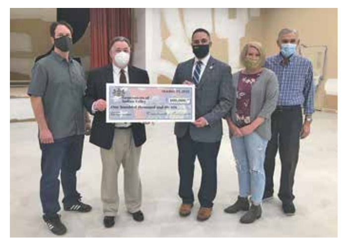
I presented Generations of Indian Valley with a $100,000 check that will help cover the costs of the facility's first upgrade to the community room since 1989.