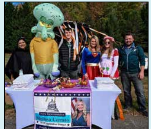
Family Resource Fair and Trunk-O-Treat