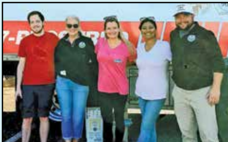
Fall Shredding Event