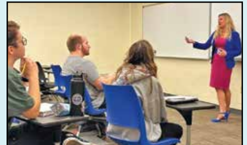
Fall 2024 MCCC Legislator in Residence Program