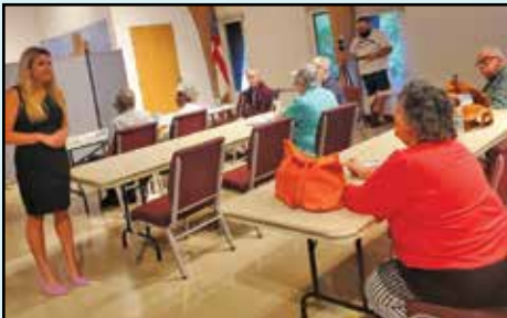
Horsham Interfaith RoadMap Life Skills Class