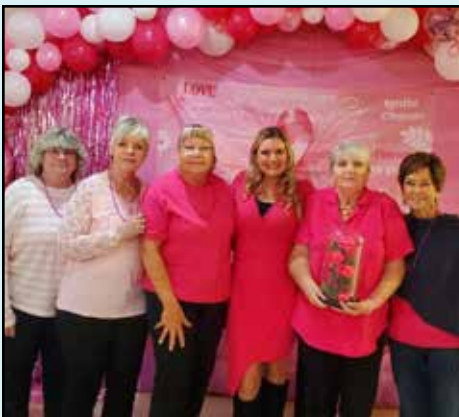
Pink Out at the Horsham VFW to Support Breast Cancer Awareness