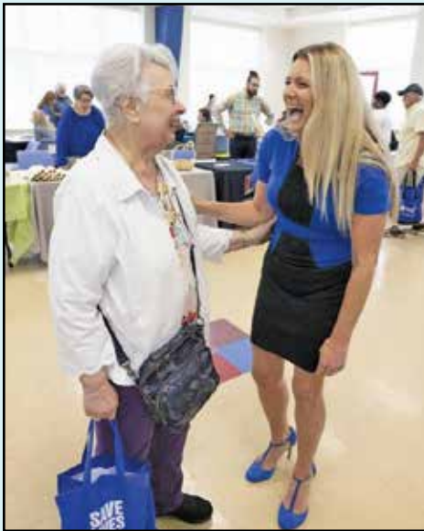
Fall Senior Fair