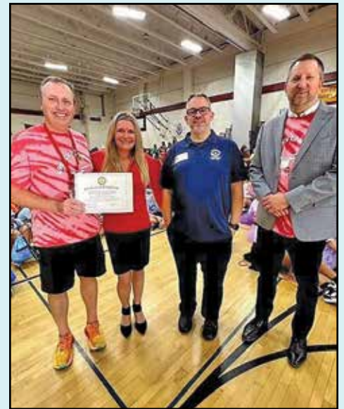
49th Annual Keith Valley Challenge