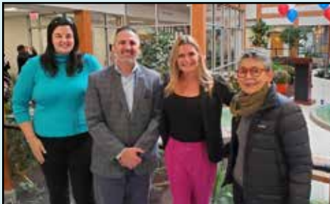
Dedication of the MCIU Discovery Center