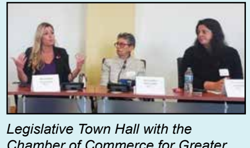
Legislative Town Hall with the Chamber of Commerce for Greater Montgomery County