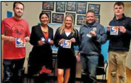
Fall SEPTA Key Card Event