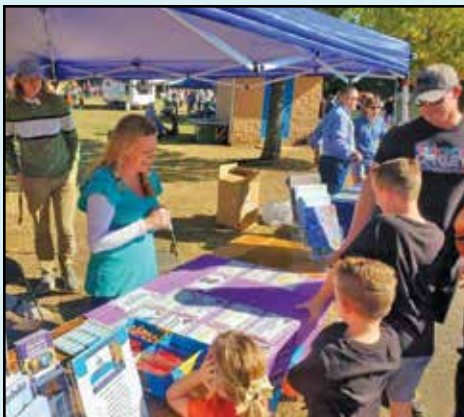
Montgomery Township Fall Festival