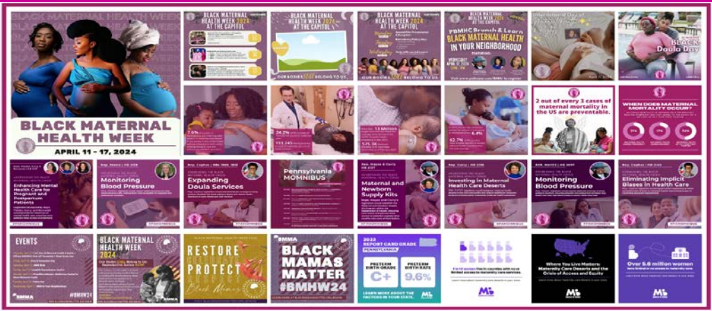
Download and Customize the PBMHC Graphics by visiting: