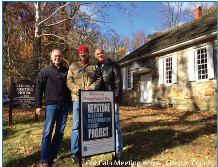
Old Caln Meeting House, Chester County

Since its inception in 1993, this program has provided over $54 million in funding to over 1,000 community projects preserving the Commonwealth's diverse array of historic properties including covered bridges, county courthouses, roller coasters, and museums.