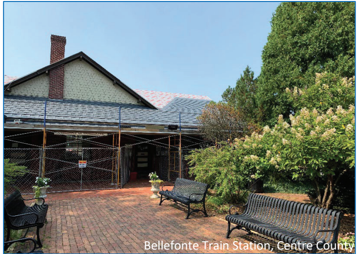
Bellefonte Train Station, Centre County

Projects funded by a Keystone Preservation Construction Grant must be reviewed and approved by PHMC prior to construction to ensure that the scope of work meets the Secretary of the Interior's Standards for the Treatment of Historic Properties . Along with accepting a declaration of covenant, grantees must ensure they will continue maintenance and preservation of the historic building and public accessibility for at least 10 years after the grant is received.