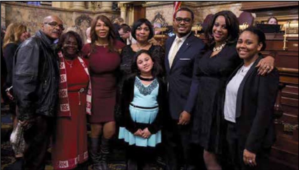
I'm so glad my family and friends were there to share one of the most memorable days of my life.