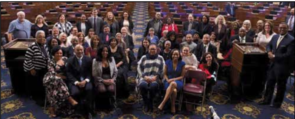
With my family, friends and colleagues in the House chamber.