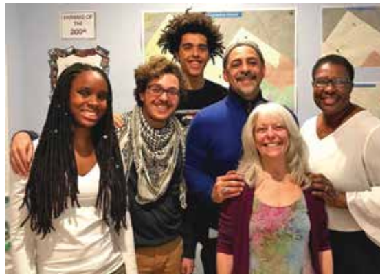
Holiday Open House with volunteers and interns.