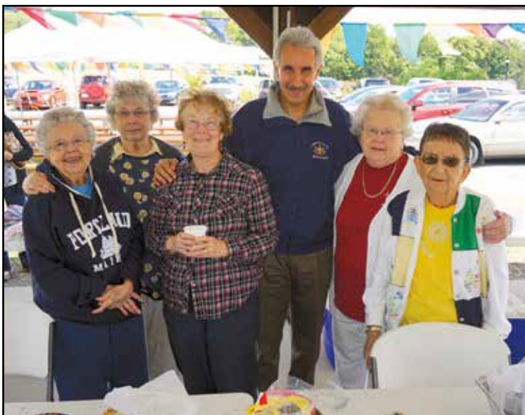
It's always a pleasure to see everyone at the New Covenant Presbyterian Church Community Festival.

Seniors 62 or older are eligible for a $4.50 discount off the normal campsite price. You can find your closest state park, prices and other frequently asked questions, as well as make a reservation, at www.dcnr.pa.gov . Reservations can also be made by calling 1-888-PA-PARKS (1-888-727-2757).