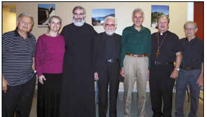
Delicious food and great entertainment are always part of the Greek Festival at St George’s Greek Church in Neshannock Township.