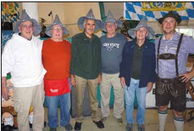
It was a beautiful day at Cascade Park last year for the Eintracht Society’s annual Oktoberfest.

Contact your local Area Agency on Aging for additional information. You may also visit the Aging Department website at www.aging.pa.gov for more information about programs to help kinship caregivers.