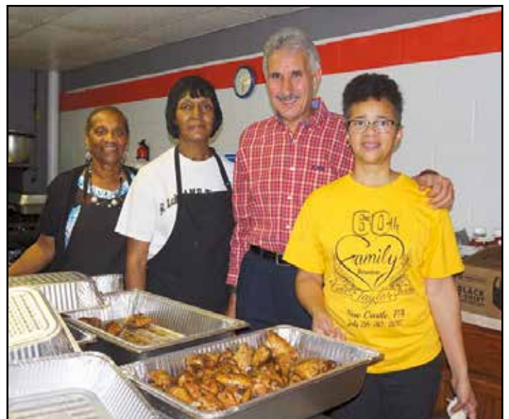
It was a pleasure to visit the St. Luke AME Church Community Day.