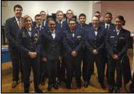
The Pottstown JROTC joined us at our Veterans Breakfast in November to honor our heroes. Thank you for your service!