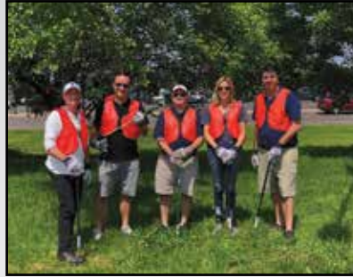
I was joined by my fellow Southeast Delegation representatives and volunteers at a litter cleanup. PennDOT spends millions every year picking up litter, money that should be going toward fixing our roads and bridges.