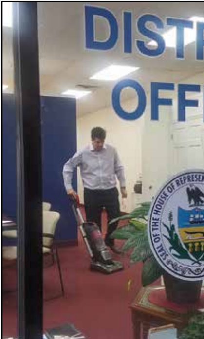
Above: Helping vacuum the district office after serving our constituents.