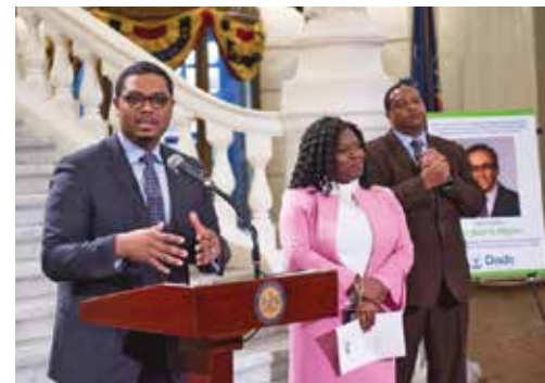
I joined House Democratic Caucus Chairwoman Joanna McClinton in the Capitol Rotunda to speak at the Coalition for Fathering Families.