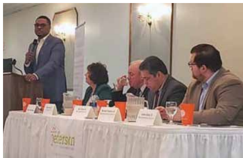
The Jefferson Regional Foundation hosted a legislative roundtable and asked me to speak about issues that impact the health and vitality of our communities.