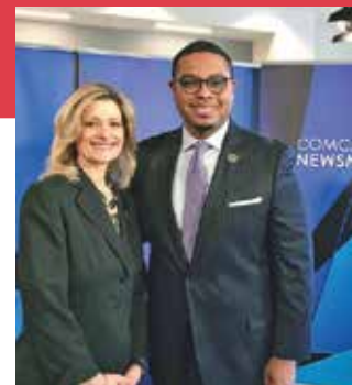
In December, I was interviewed by Comcast Newsmakers on what's happening in the state Capitol and the 35th District.