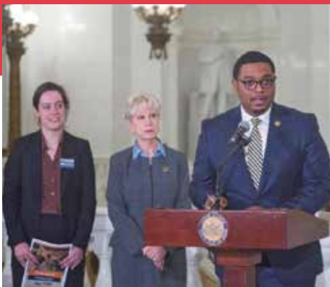
I spoke at the Capitol to roll out a bipartisan legislative package that would require mandatory lead testing in schools.