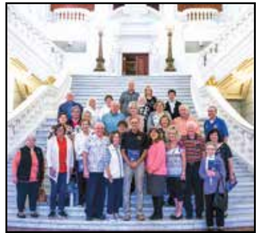
Thank you to the wonderful people who joined the bus trip from our area to visit me at the state Capitol and Fort Hunter in Harrisburg this fall.