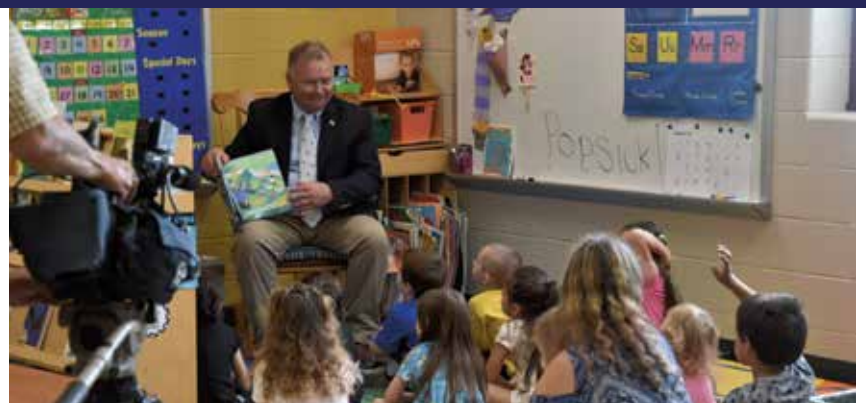
It was a joy reading to the engaged pre-K students at Iroquois Elementary School.

In addition to the basic and special education funding, our school districts and others throughout the state will each receive more than $200,000 to fund school safety and mental health resources.